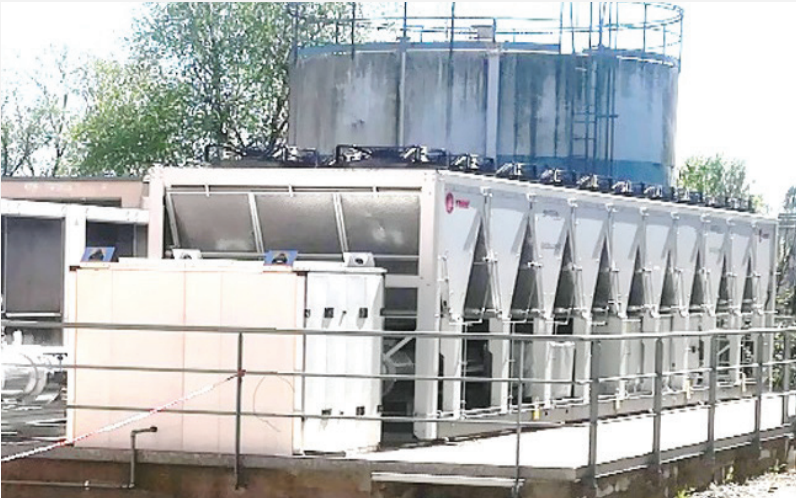
MEASURED COOLING CAPACITY AND COOLING CAPACITY INCREASE

During summer, the electricity consumption of the hospital’s cooling equipment accounts for 52% of the total electricity consumption – a heavy strain on the operational budget of the hospital. During the region’s hot summer, when outside temperatures can reach over 35°C, there is a sharp decrease of cooling capacity of around 19%. The responsible HVAC engineers recognized there was indeed a deficit of cooling capacity and overload of the chiller compressors.