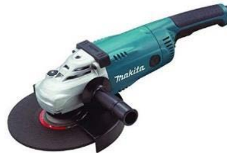
7. Angle grinder 4 1/2"