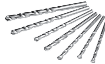
19. Drills set for metal 3-12mm