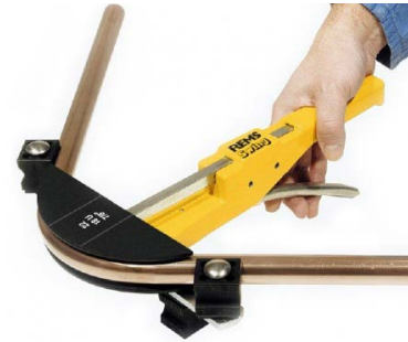
27. Hand electric pipe bender