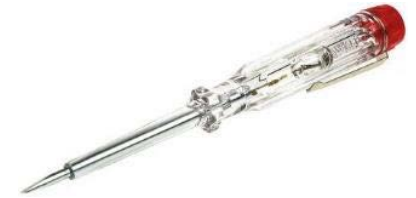
28. Indicator screwdriver