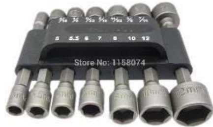
10. Screwdriver nozzle (with magnets) set for bolts