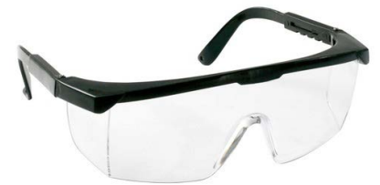
16. Protective glasses