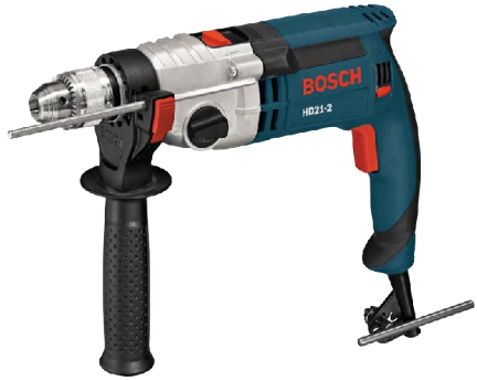
17. Electric drill with hammer