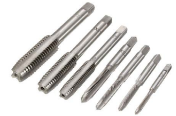
20. Thread tap set