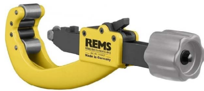
14. Pipe cutter (for pipes up to 1/2")