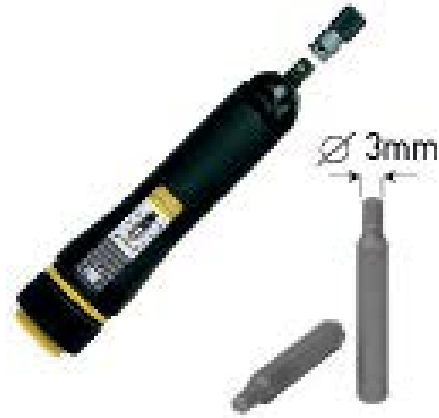
2. Torque Screwdriver XH3 (3mm), 2.2 N·m (newton meters).