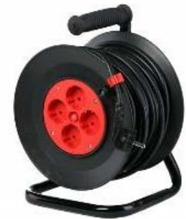
8. Extension cord reel 50m