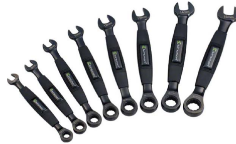
3. Set of wrenches 6-22mm