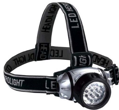
22. Head flashlight