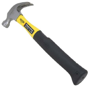
5. Hammer tool