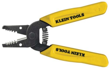
25. Cable stripper