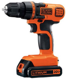
1. Electric screwdriver (18V for better comfort) x 2 for faster installing.