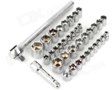
4. Spanner socket set