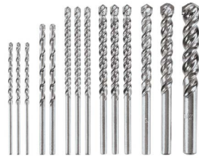
18. Drills set for concrete 3-12mm