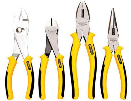
12. Pliers set