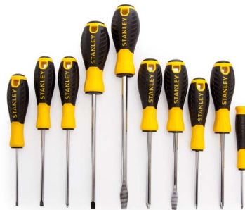
6. Screwdriver Set