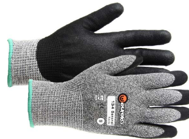
15. Protective gloves