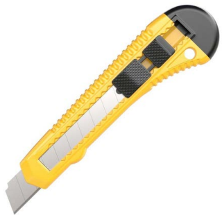
21. Work knife