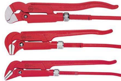
11. Plumbing wrenches set