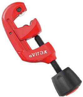
13. Pipe cutter for stainless steel pipe