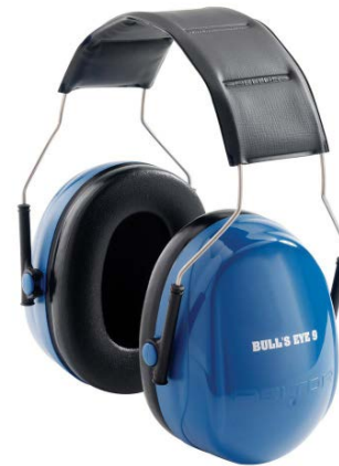
23. Ear protection