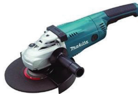
7. Angle grinder 4 1/2"