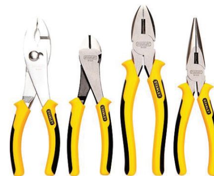
12. Pliers set