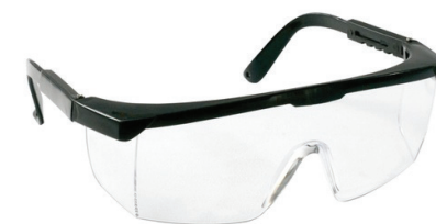
16. Protective glasses