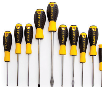
6. Screwdriver Set