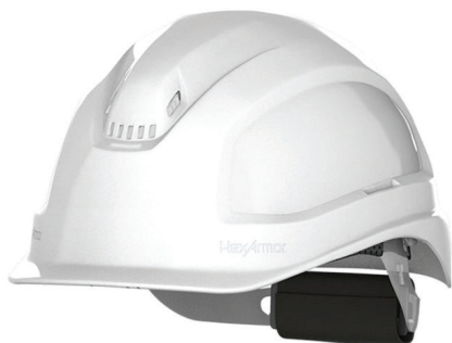
29. Safety helmet