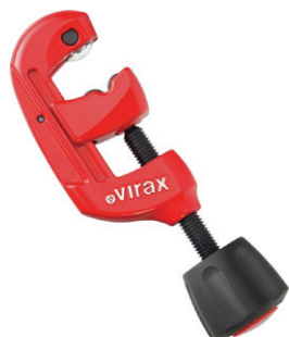
13. Pipe cutter for stainless steel pipe