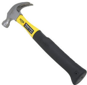
5. Hammer tool