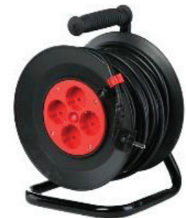
8. Extension cord reel 50m