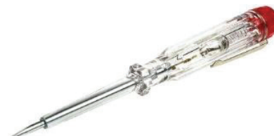
27. Indicator screwdriver