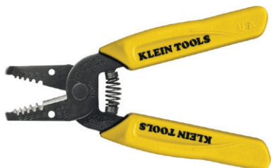
25. Cable stripper