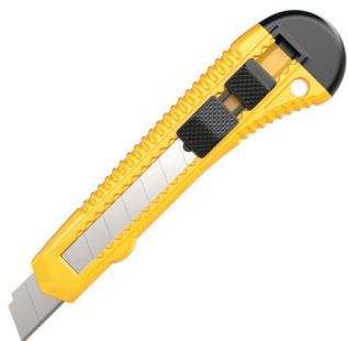
21. Work knife