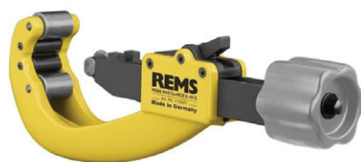
14. Pipe cutter (for pipes up to 1/2")