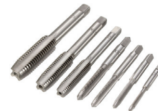
20. Thread tap set