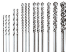
18. Drills set for concrete 3-12mm