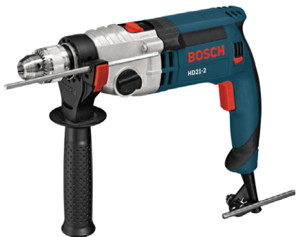
17. Electric drill with hammer