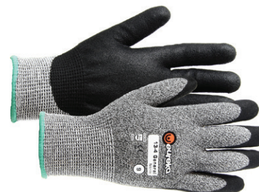
15. Protective gloves