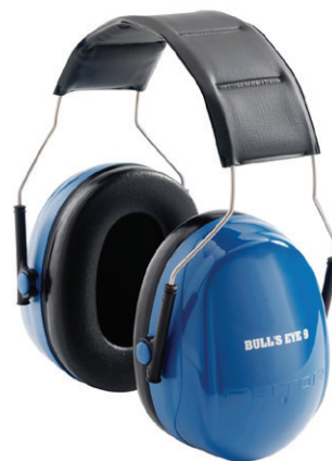
23. Ear protection