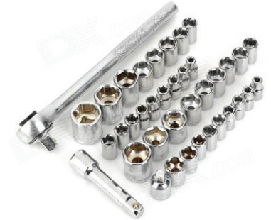
4. Spanner socket set 6-24 mm