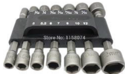
10. Screwdriver nozzle (with magnets) set for bolts