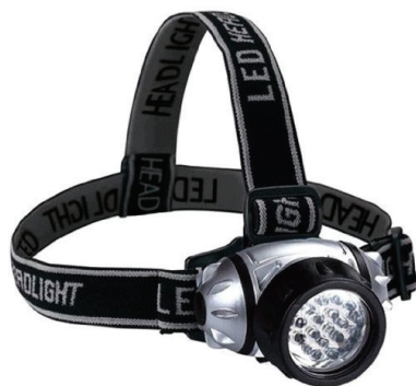
22. Head flashlight