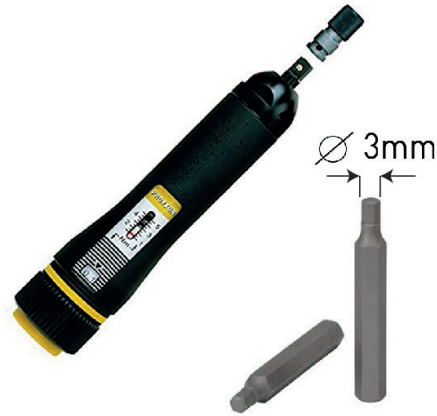
2. Torque screwdriver XH3 (3mm), 2.2 N·m (newton meters).