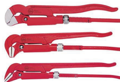
11. Plumbing wrenches set