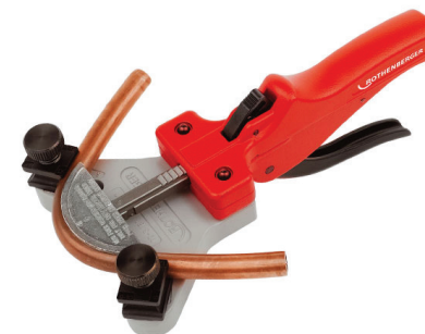
28. Hand pipe bender