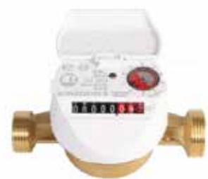
COMBI water meter with M-Bus protocol

Equipment tested: Air-cooled water chillers, TRANE RTAC 185 .