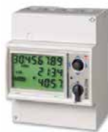
Network Analyzer with M-Bus protocol