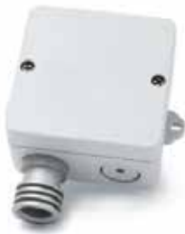
Temperature/RH sensor with M-Bus protocol