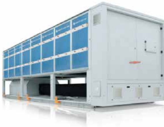
Air cooled water chiller TRANE RTAC 185