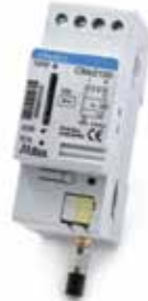
M-Bus GPRS Gateway Cme2100