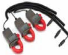
Current sensors, clip-on probes