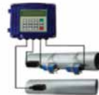
Ultrasonic flowmeter RIF 600