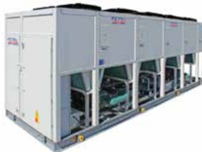
Air cooled water chiller Petra APSa 325-2

The measured energy savings delivered by Smart Cooling ™ over the 4-day ON period were: 9,308 kWh saved