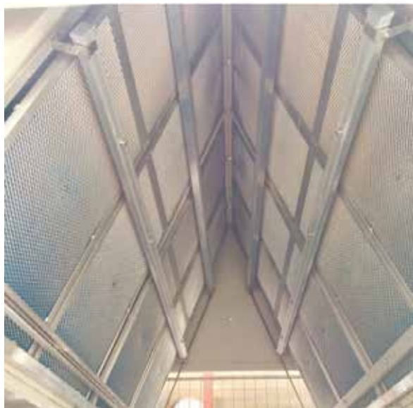
System installation on chiller condensers

Smart Cooling ™ ensures 100% condenser protection from direct contact with water.