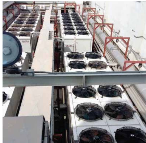
Existing chillers on site