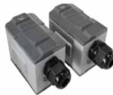
Cooling power calculator